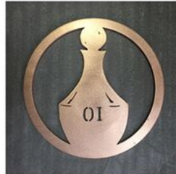
Anointing the Sick